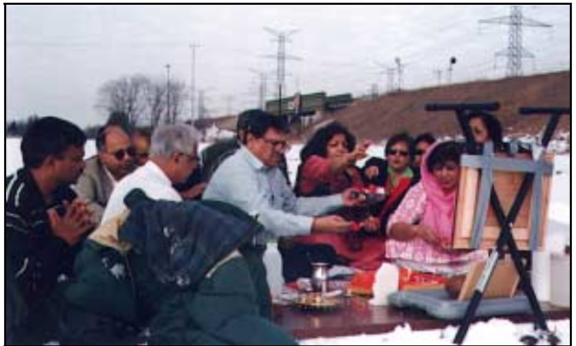
Feb 22, 2000: Devotees performing prayers on the Markham land.

This has been further confirmed by Bhagawan who gave a vision to one of our Centre members and asked that we do prayers on the Markham land. Such a prayer was organized on February 22 with a havan on the snow clad surface of the land.